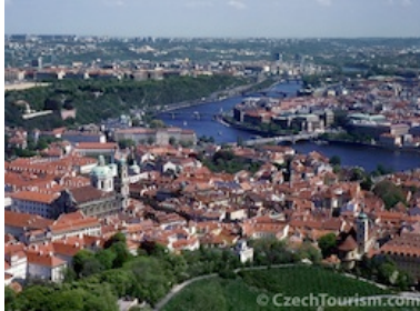
Aerial View of Prague

Exploration of Prague Castle (founded after 880 as the seat of Bohemian princes) with a visit to St. Vitus Cathedral (Prague's biggest and most important church dating to 926 when the original Romanesque rotunda was built), St. George Basilica (the oldest surviving church in the city dating to 921), and the Royal Palace (an original early medieval Romanesque palace with Gothic and Renaissance additions that served as the residence of the Czech kings until the 16th century when the Habsburgs turned it into state offices) including the viewing of The Story of Prague Castle exhibit.