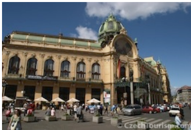
Prague Municipal House