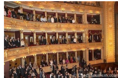
Prague State Opera