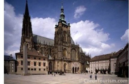
St. Vitus Cathedral

Trip to Nelahozeves, the birthplace of Antonin Dvorak , to visit Dvorak Museum and to view the Lobkowitz exhibit Private Spaces: A Noble Family at Home at the monumental Nelahozeves Chateau (one of the significant Renaissance buildings in Bohemia built in the middle of the 16th century)