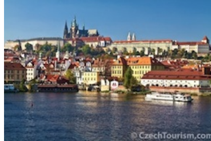
Vltava River and Prague Castle