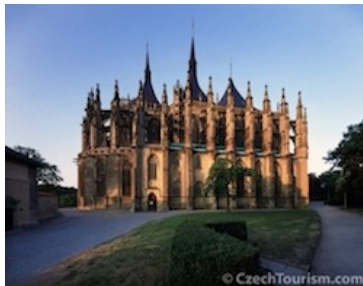
St. Barbara's Cathedral

Trip to Kutna Hora (one of the medieval Europe's largest source of silver and the second most important town of the former Kingdom of Bohemia) to visit late Gothic St. Barbara's Cathedral, the Czech Silver Museum, and the Church of All Saints with its Ossuary notable for a unique decoration made from human skulls and bones.