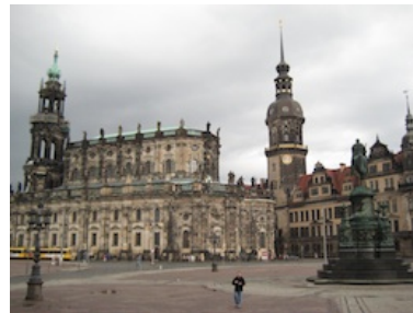
Dresden Cathedral and Royal Palace